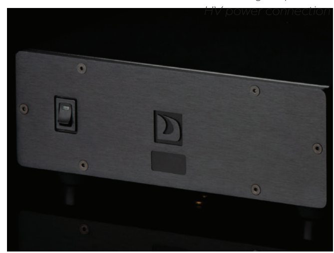
Front of PSU