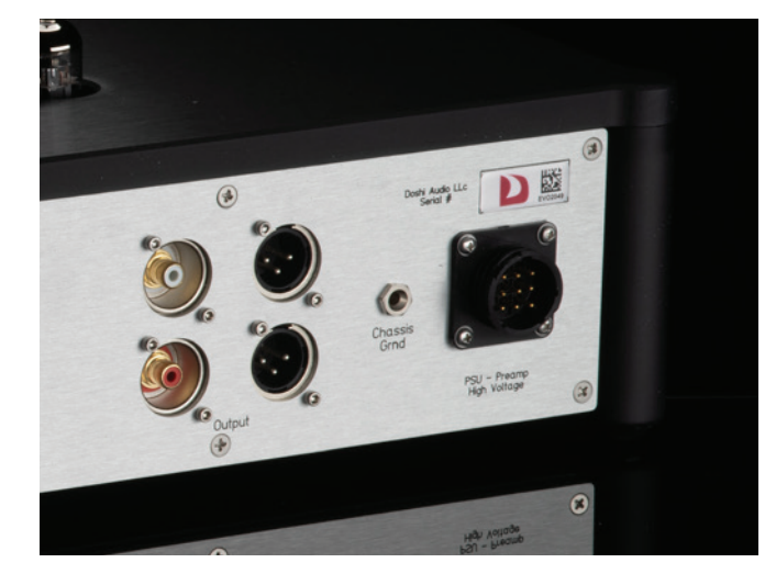
Rear of Audio unit showing output and