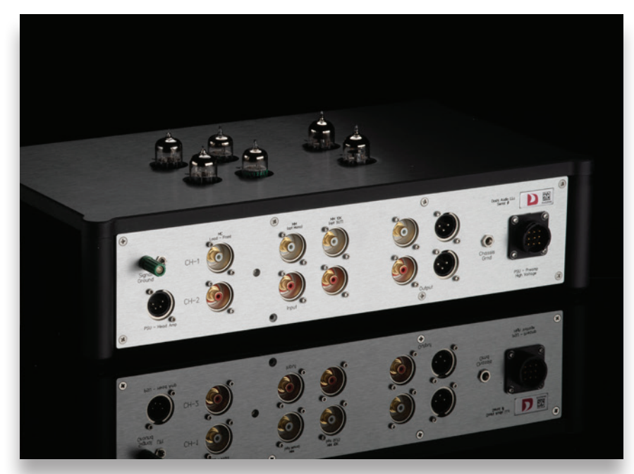
Rear panel showing inputs, outputs and PSU connections