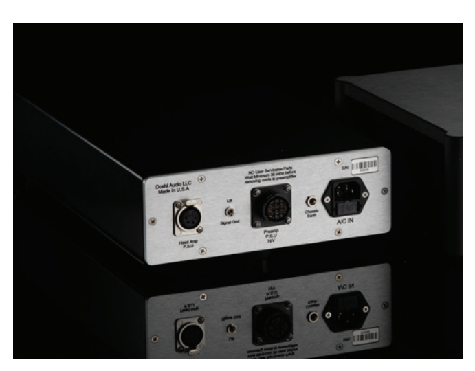
Rear of Power Supply